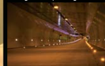
Railway Line Upgrade, Section Votice-Benesov u Prahy - Olbramovický Tunnel