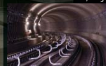
Underground Utility Tunnel Wenceslas Square - Line C, Prague