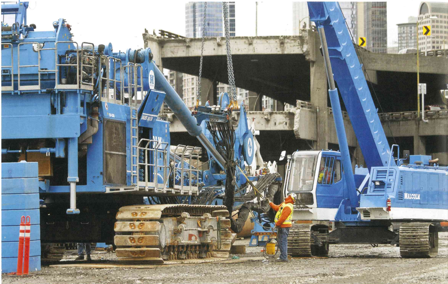
Above: Malcolm Drilling crews set up the drill rigs that will build the walls for the SR 99 tunnel boring machine launch pit

project, but left it to the design-build contractor to determine the exact nature of the machine – the contract allowed us to select either a Slurry or EPB. STP has chosen to utilize an EPB TBM as in the Seattle area there has been a variety of tunnelling techniques used but with respect to pressurised spaced the majority of the work has been done with EPBMs.”